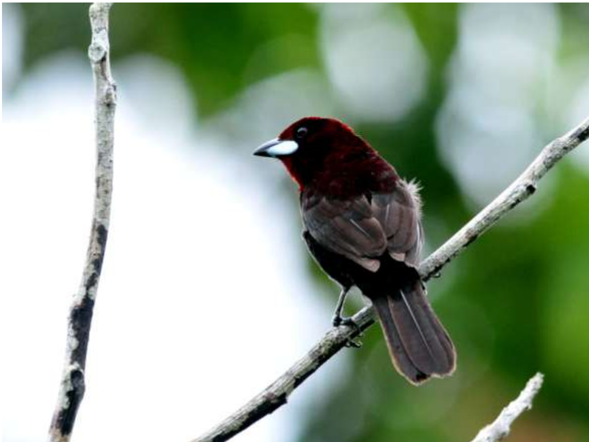
Silver-beaked Tanager (2011)

At around 8:00 AM, we started to walk the road. I hurried to get something in the room and was surprised to see the group already at the gate when I came back out, since there was still some activity around the light post. It was starting to rain again and looked like it might rain hard, so I went to the deck where John had stayed to take photographs. We birded from there and had Tropical Parula and female Silver-beaked Tanager and not much else that was new. We went back to the light post and found just a few birds, most impressively a breeding plumage Canada Warbler and a Yellow-tufted Woodpecker . We decided to go on down the road after I commented that the group was probably getting about 50 new species, and we were moving in that direction when, at about 9:15, Peggy and Charlie returned from their antpitta adventure. They had seen both species but the 45-minute experience that was supposed to include a 15-minute walk had actually taken two hours with a very long walk that involved steep slippery trails. They were wet and tired, but beaming from the experience. We followed them to the deck and quickly found a Squirrel Cuckoo and Channel-billed Toucan . A hawk landed on a snag that we could not identify, so we snapped photos for later identification – White-rumped Hawk juvenile. Thick-billed and Orange-bellied Euphonias landed in the "hot" tree.