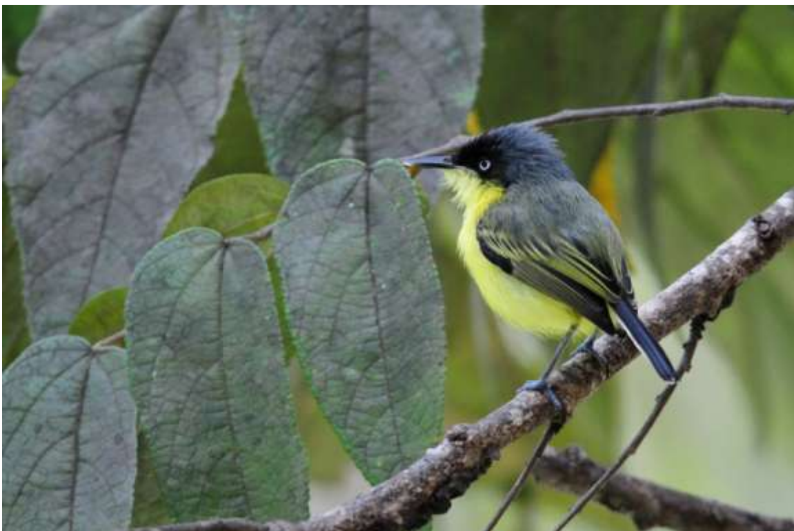
Common Tody-Flycatcher (Panama 2012)