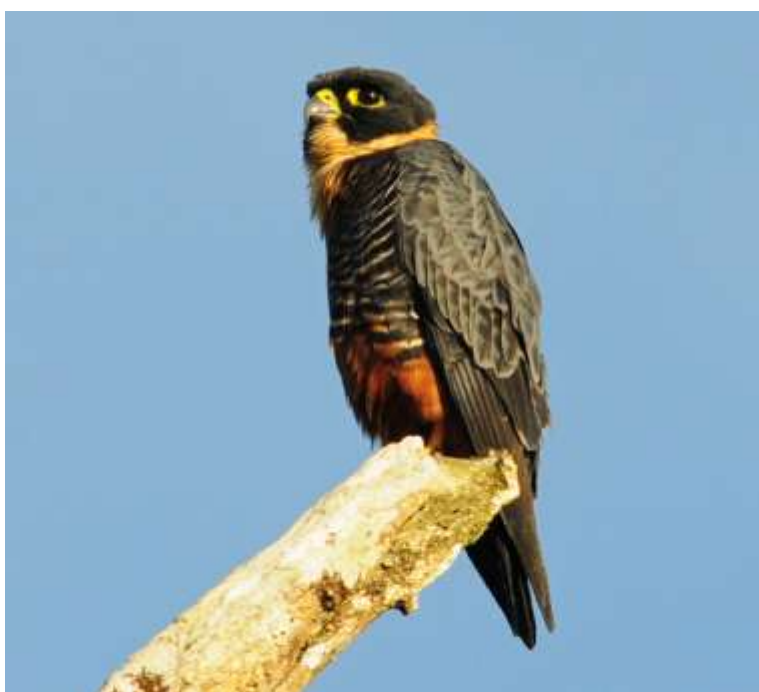
Bat Falcon (Panama 2012)

In spite of how great the rest of the trip was, the Napo was the highlight for us. The canoe rides were special, and the evening we came back after dark from the canopy tower, with the night noises and the thousands of lightning bugs lighting up the edge of the water, was simply magical. (Bob)