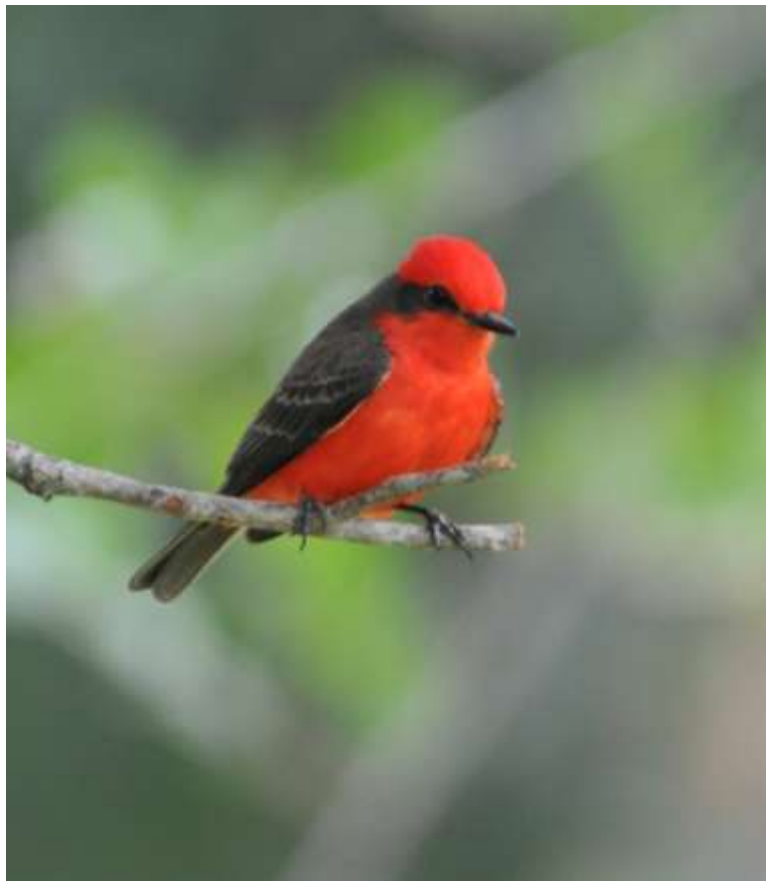
Vermilion Flycatcher (2010)

Our first stop was a lovely restaurant near the museum where we had an excellent meal. Next, we were off to the Equator Museum, the section of the complex that I call the “fun part” because a guide leads you through several exhibits, including one on shrunken heads, one about Amazonian wildlife including the infamous “Penis fish”, and a well-preserved native structure built in 1875. At the end, our guide gave an informative and entertaining presentation about the equator and some of the strange effects that occur when you stand at the middle of the Earth. By moving a pan of water with a drain a mere 10 feet away from the line that marked the Equator, she demonstrated the Coriolis Effect with leaves that swirled counterclockwise when positioned north of the line, clockwise when positioned south of the line, and no swirling at all when directly on the line. She explained how ancient people knew they were at the middle of the Earth, why for 3 minutes you have no shadow on the spring and fall equinoxes, why you are able to balance a raw egg on its end more easily on the Equator, how sun dials work on the Equator, and much more. Peggy’s favorite demonstration involved being able to out-muscle Charlie while standing directly on the Equator. A good time was had by all, and everyone was quite pleased with our one cultural day of the trip. As we loaded the bus to depart, I spotted a brilliant male Vermilion Flycatcher perched at the side of the road.