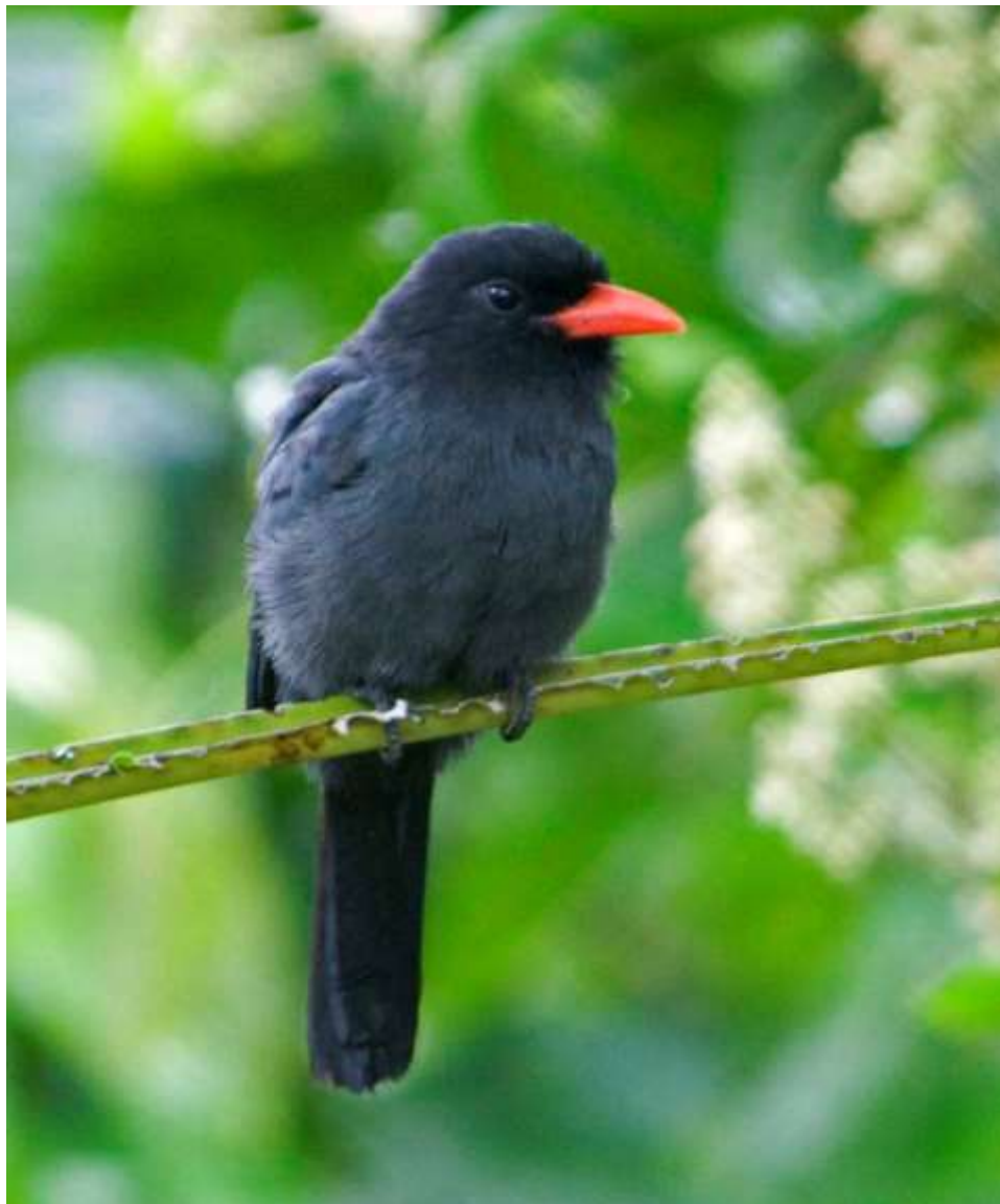
Black-fronted Nunbird (2010)

Shortly after turning onto Loreto Road, Susan called out that she had seen a group of birds on the ground. Luis stopped quickly and backed up in time for all of us to see one of the Undulated Tinamous she had spotted. New bird #1. We spotted lots of birds along the way, but most were not new for the trip: Roadside Hawk, Blue-headed Parrot, Swallow Tanager, Palm Tanagers, Chestnut-bellied Seedeater. A Violaceous Jay flew by quickly - New bird #2. Now we had traveled far enough that we were beginning to find some new birds such as Black-capped Donacobius (#3) and Red-breasted Blackbird (#4). Someone spotted a Black-fronted Nunbird (New bird #5) as we were crossing a bridge with a large truck following us, so we had to go on and then put the scope on the bird once we could stop. Here, we also found Yellow-rumped Cacique (#6). Two Yellow-headed Caracaras (#7) came flying toward us down the middle of the road, but only a few people near the front saw them well. A Black Caracara was seen being chased by a Tropical Kingbird . One of the best new birds seen on the drive was the incredibly gorgeous Cream-colored Woodpecker (#8). A Great Kiskadee (#9) was seen at the side of the road. When we arrived in Loreto we stopped at the gas station. There we found Gray-breasted Martin (#10) and enjoyed a better look at a Violaceous Jay . Galo pointed out a Ruddy Ground-Dove (#11) on the wire as we started to drive away, as well as a Swallow-tailed Kite soaring overhead.