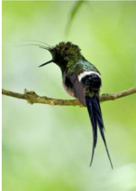
Wire-crested Thorntail (2011)