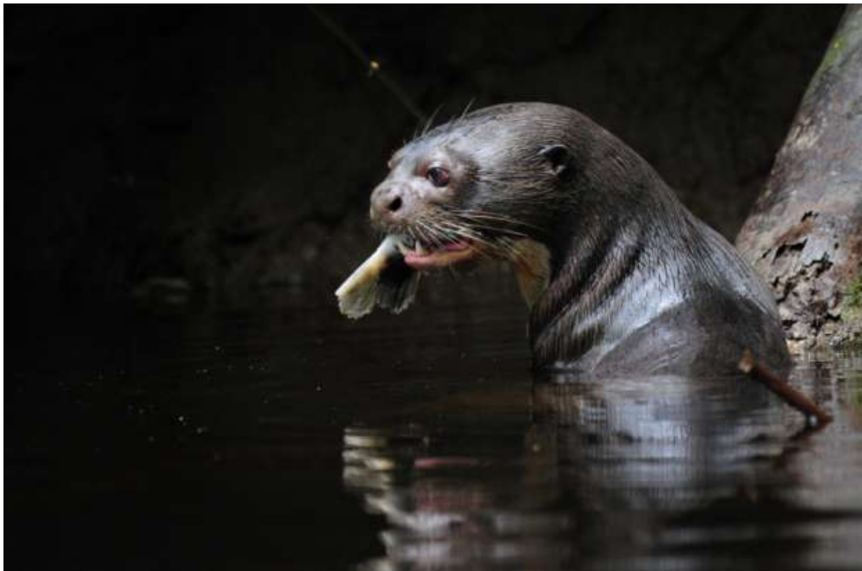
Giant River Otter

Just 10 minutes up the Anangu Creek, we saw two Giant River Otters , one with a big fish, the other looking on hopefully. The otter with the fish was a bit larger and had no intention of sharing his treasure with the smaller otter. We sat in silence for quite a few minutes as one otter crunched through the bones of the fish and the other rested its head on a stick in the water. We delighted in the sounds they made, and would have been content to watch longer, but the otters decided to move on.