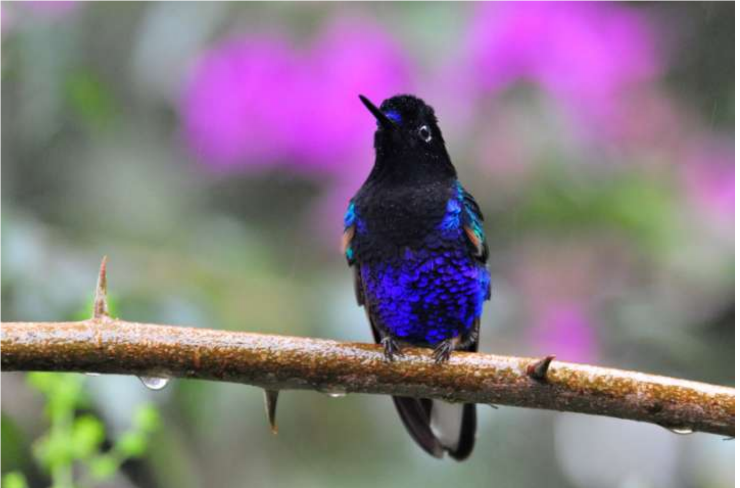
Velvet-purple Coronet (2011)

Racket-tail and Violet-tailed Sylph among many other hummingbirds that they couldn't identify. After dinner, we completed today's list, finishing the day with 41 species, of which 9 had been seen on the first "non-birding" day, bringing our trip total to 46 species.