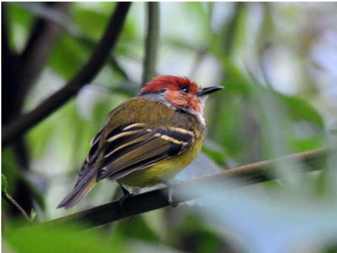
Rufous-crowned Tody-Flycatcher (2011)

Today I spent the entire day under the covers trying to eliminate the chills I was experiencing. The people at San Isidro were very accommodating, bringing a small space heater to warm the area. It rained off and on all day today, keeping the temperature lower than normal for this area. The rest of the group went after breakfast to see the White-bellied Antpitta being fed, but unfortunately the Peruvian Antpitta didn't come for the worm offering today. ,