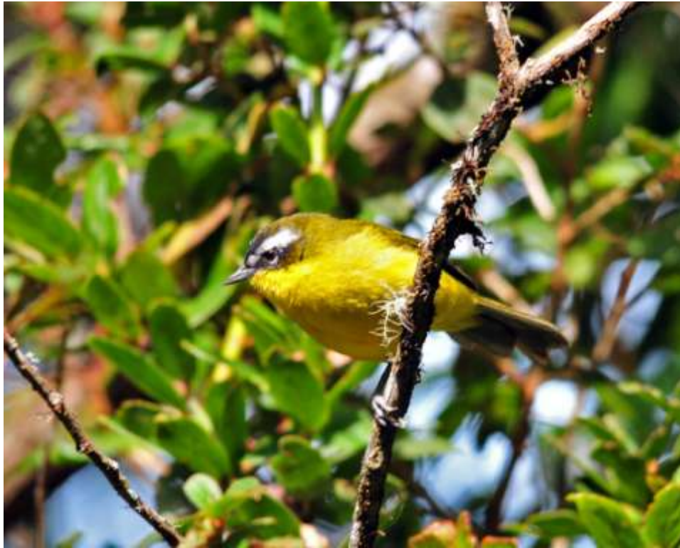
Superciliaried Hemispingus (2011)

There was some bird activity as we were walking back, first a group of Rufous Wrens , then a Scarlet-bellied Mountain-Tanager that was much more cooperative than the first one seen from the bus on the way in. Black-chested Mountain-Tanager was seen sitting low at the road's edge, but by now the fog was settling in so the views, although close, weren't perfectly clear.