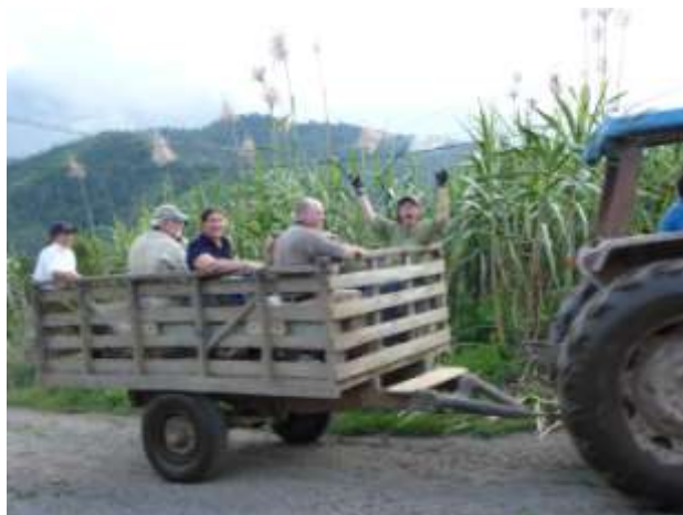
Back from the Oilbird roost!

When the "Oilbird Gorge Group" arrived back at the farmhouse, they were ecstatic. Their faces were beaming, their clothing muddy, their muscles sore, and their spirits soaring. As they enthused about the experience they had just had, I knew I had made the right decision about insisting that they be taken to the gorge. Sometimes stubbornness is a good thing.