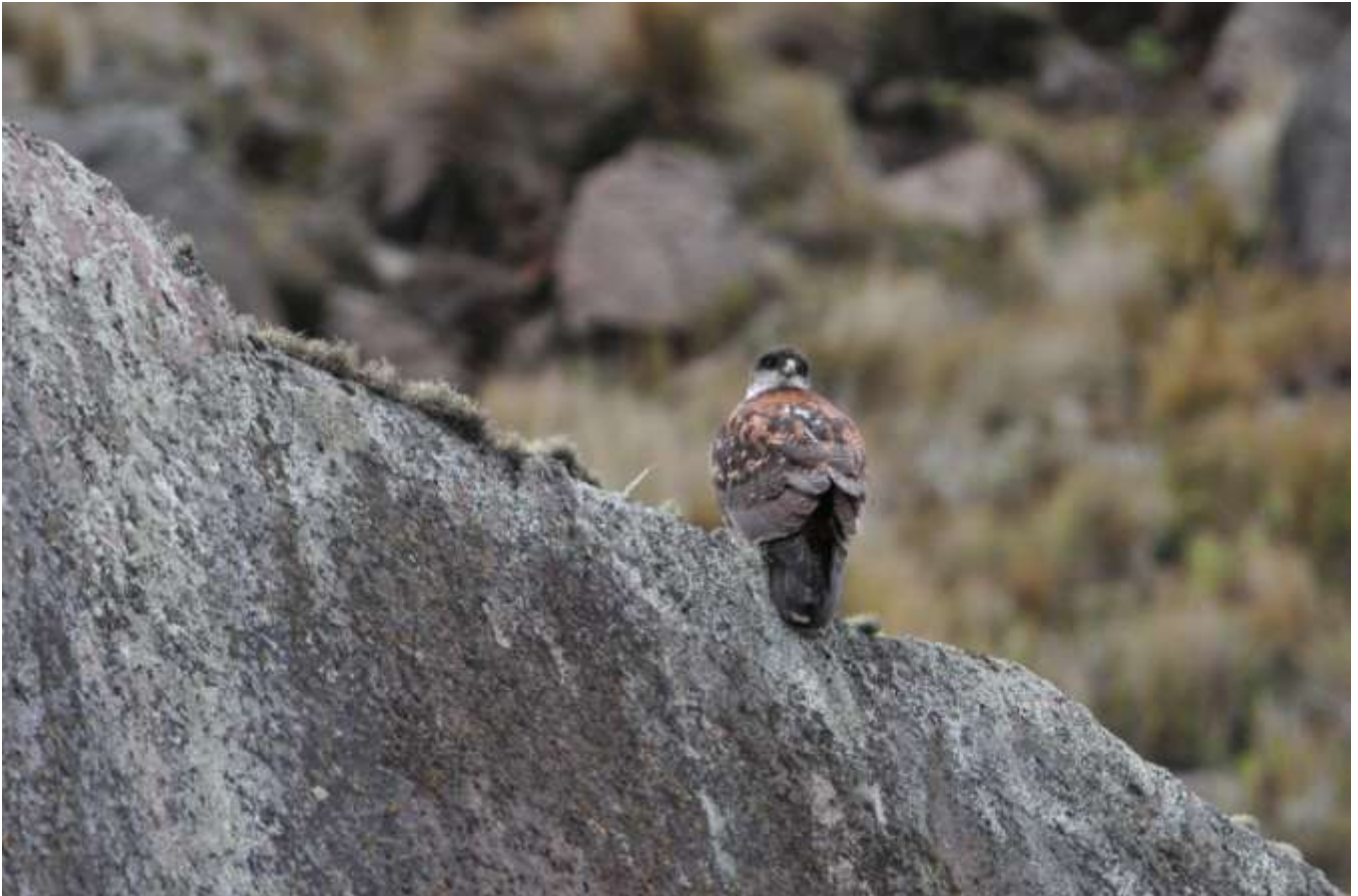
Variable Hawk (2011)

Shortly after we drove away from this productive spot, Luis found our first Andean Condor in the air! Everyone piled out quickly and got good looks at the flying bird, but I didn't see a lot of white on the back, making me wonder if the bird was an immature or female. With this sighting out of the way, the guides could breathe a little sigh of relief. No one