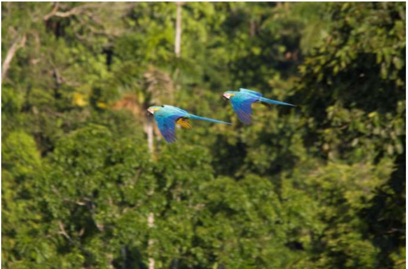
Blue-and-yellow Macaws (2011)

The group went out in canoes most mornings, returned to the lodge (or Bodega) at midday for lunch and a break, and then went back out for a second birding outing in the afternoon. They went twice to the 120-foot tower that is built into a towering Ceiba tree, walked the Tiputini Trail in search of some specialty birds, visited the famous Yasuni National Park Parrot Licks, searched for endemics on islands of the Napo River, and visited a cultural center run by the Quichua Indians. During one morning of rain, they birded from the tower at the lodge, and they had at least one outing where they birded from canoes around the lake and creeks.