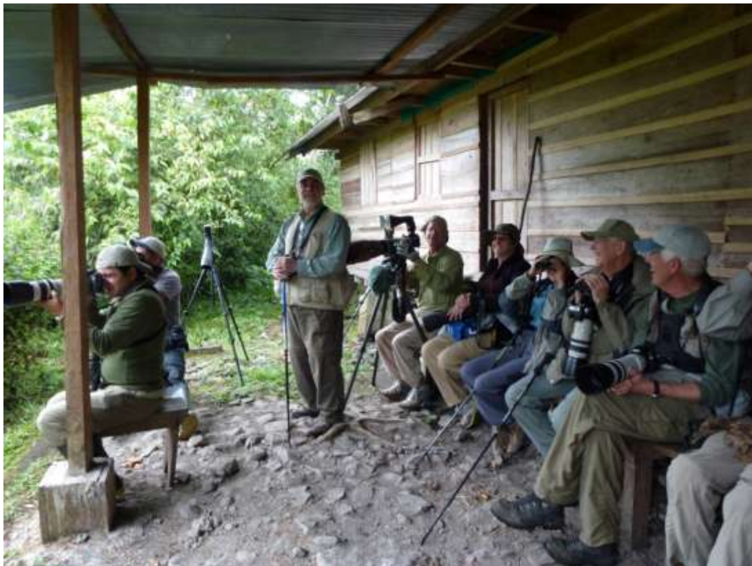
Shelter at second set of feeders, Wild Sumaco