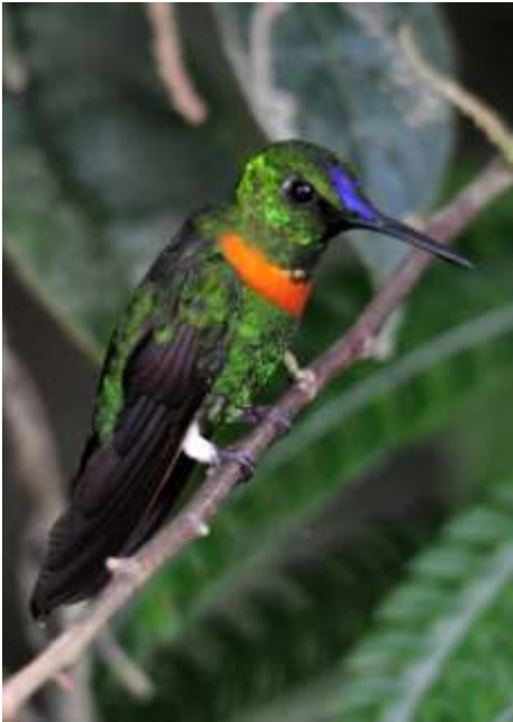
Gould's Jewelfront (2011)

We had quite a few new birds from the deck of Wild Sumaco Lodge before it started to rain again, including Speckled Chachalaca , Maroon-tailed Parakeet , Squirrel Cuckoo , Green Hermit , Violet-headed Hummingbird , Wire-crested Thorntail , Gould's Jewelfront , Black-throated Brilliant , Many-spotted Hummingbird , Fork-tailed Woodnymph , Golden-tailed Sapphire , Violet-fronted Brilliant , the eastern subspecies of Booted Racket-tail wearing its orange boots, Gorgeted Woodstar , and Eastern Wood-Pewee .