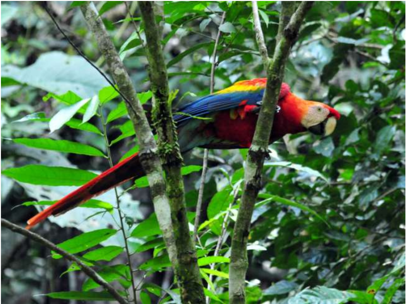
Scarlet Macaw (2011)

Bird count for Sunday, Feb. 26 , when the group went to the river islands and parrot licks and visited the Quichua cultural center, was 80. Of that number, 37 were new, bringing the trip total to 489. New species recorded that day: Cocoi Heron, Snowy Egret, Boat-billed Heron, Salvin's Curassow, Wattled Jacana, Greater Yellowlegs, Least Sandpiper, Pied Plover, Collared Plover, Scarlet Macaw, Cobalt-winged Parakeet, Great Potoo, Ladder-tailed Nightjar, Great-billed Hermit, Straight-billed Hermit, Blue-tailed Emerald, Olive-spotted Hummingbird, American Pygmy Kingfisher, White-eared Jacamar, Chestnut-eared Aracari, White-bellied Spinetail, Wedge-billed Woodcreeper, Cinereous Antshrike, Gray Antwren, Spot-winged Anbird, Silvered Antbird, Plumbeous Antbird, River Tyrannulet, Fuscous Flycatcher, Drab Water-Tyrant, Riverside Tyrant, Amazonian Umbrellabird, Golden-headed Manakin, Blue-crowned Manakin, Orange-headed Tanager, Lesson's Seedeater, and Oriole-Blackbird.