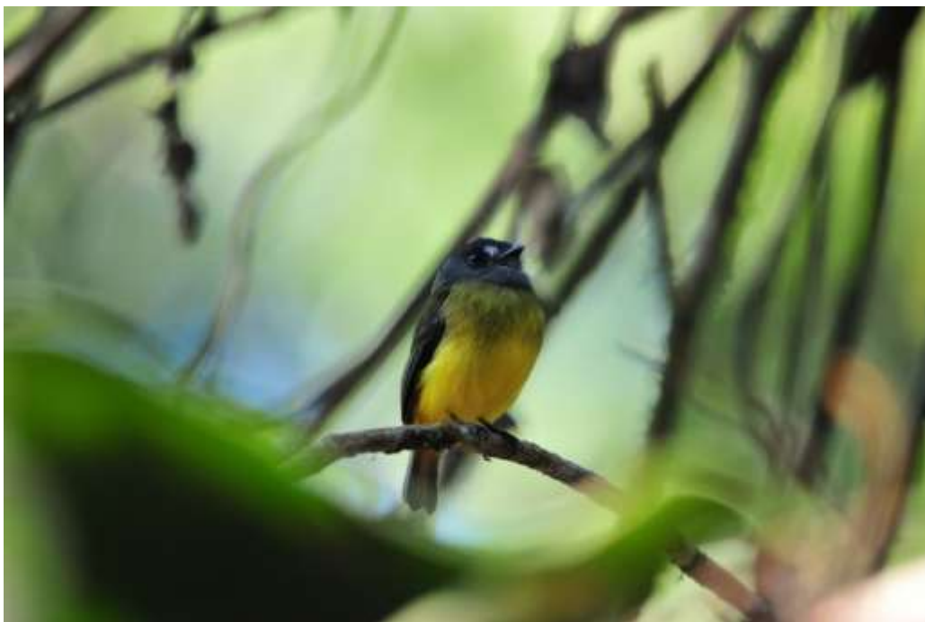
Ornate Flycatcher (2011)