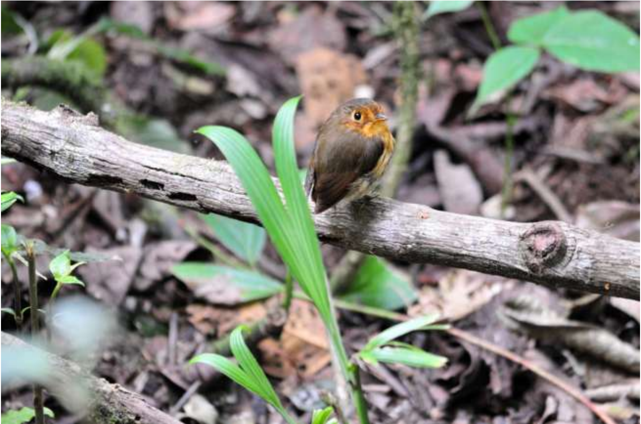
Ochre-breasted Antpitta (2011)